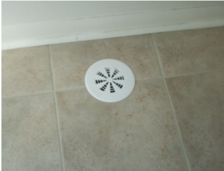
Floor Mounted Diffuser