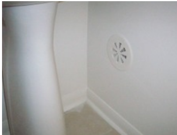
Wall Mounted Diffuser