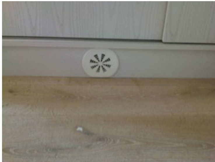
Kick-plate Mounted Diffuser