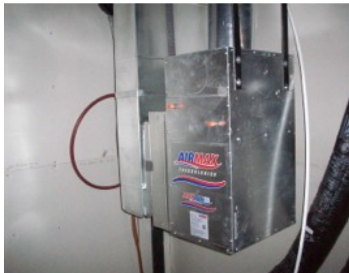
Air Handler – Hung from straps