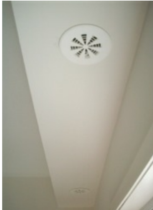
Ceiling Bulkhead Mounted Diffuser