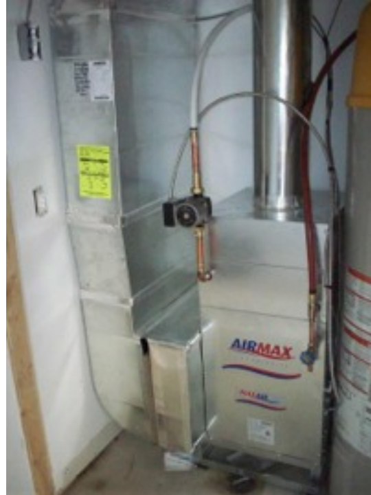
Air Handler – Floor mounted