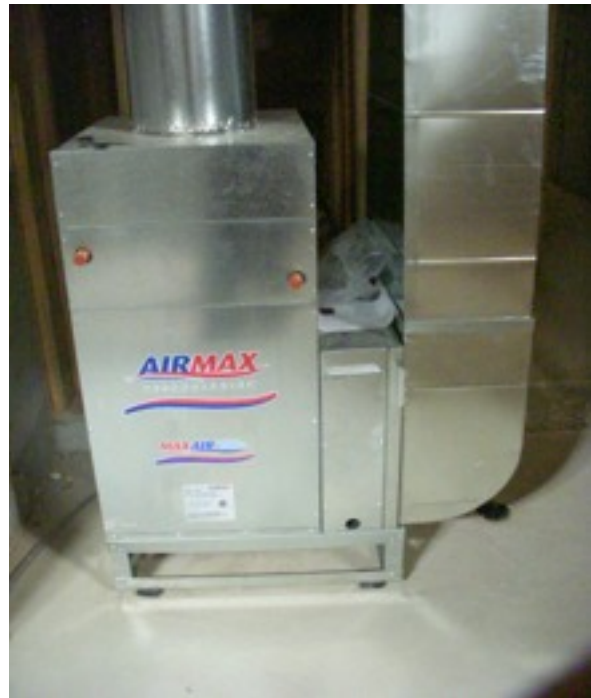
Air Handler with Optional Cooling Coil Filter Frame