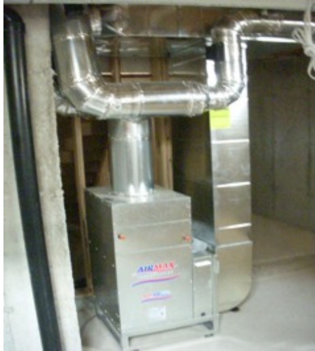
ECM Air handler with optional Prioritization system